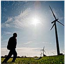
Self-Sufficiency From Straw and Turbines