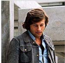
Room for Debate: Art, Crime and Polanski