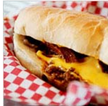
Fast Food Even Before Fast Food