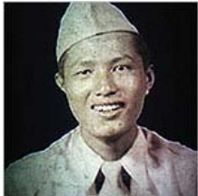
Immigration Stories in the Spotlight