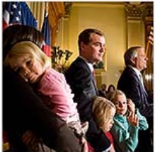
Colorado Democrats Brace for Primary Contest